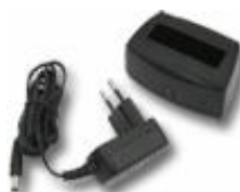
Battery charger & Power supply