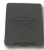
SD card holder